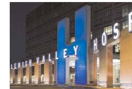
Lehigh Valley Hospital—Muhlenberg Route 22 and Schoenersville Road, Bethlehem