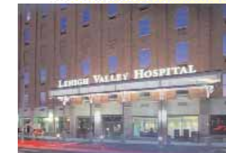
Lehigh Valley Hospital—17th and Chew 17th and Chew Streets, Allentown